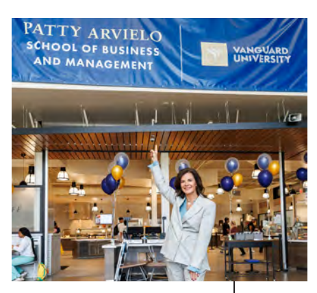
PATTY ARVIELO SCHOOL OF BUSINESS AND MANAGEMENT LARGEST ACADEMIC GIFT IN VU HISTORY