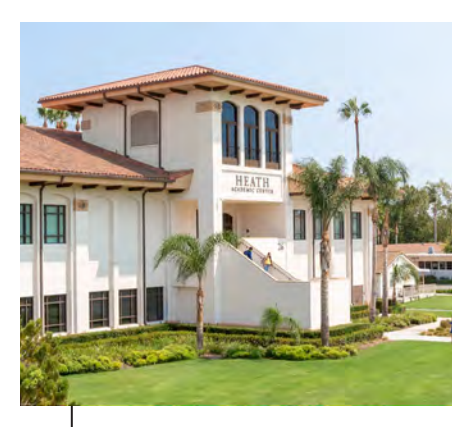
HEATH ACADEMIC CENTER EXTERIOR IMPROVEMENTS $200,000