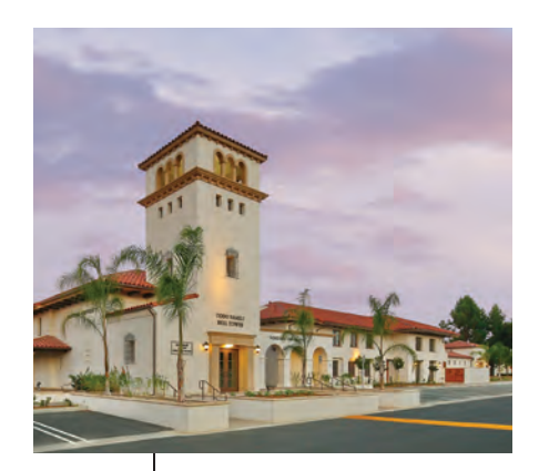
RENOVATION AND EXPANSION OF SCOTT ACADEMIC CENTER $7,048,000

THE VU COMMUNITY OF SUPPORTERS HAS GENEROUSLY DONATED $63 MILLION THROUGHOUT THE LAST DECADE. BELOW IS A TIMELINE OF NOTABLE CAMPUS IMPROVEMENTS SINCE 2013.