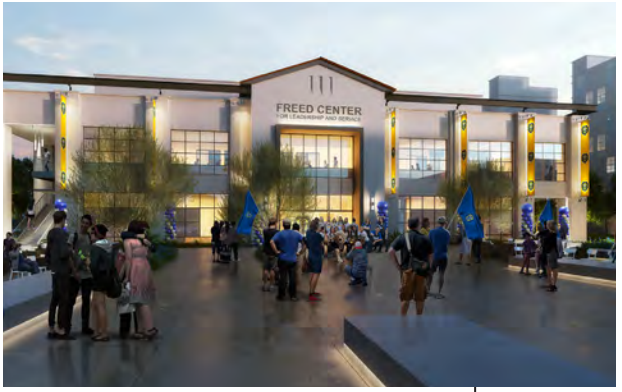
FREED CENTER FOR LEADERSHIP AND SERVICE AND ENDOWMENT: IMAGINE CAMPAIGN, MILESTONE II $18,800,000