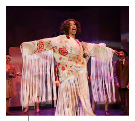
LYCEUM THEATER RENOVATION $750,000